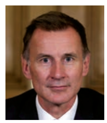
Official portrait of Jeremy Hunt MP

Nevertheless, the OBR says that Mr Hunt will meet his fiscal rule of debt falling as a proportion of gross domestic product (GDP) in 2028/29, by which time total borrowing will exceed £3,000 billion. The margin by which the Chancellor meets the rule is just £9 billion, which the OBR notes is "a tiny fraction of the risks around any forecast".